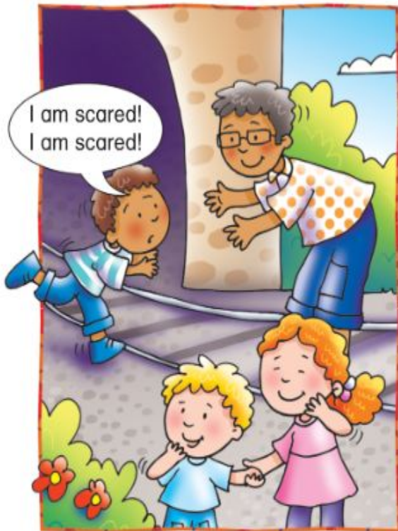
Max runs to the giant door. He sees Dad, Kitty and Zack. 'I am scared! I am scared!' says Max.