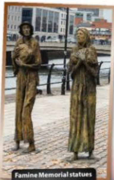
Famine Memorial statues in Dublin