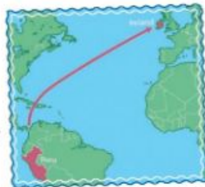
The passage of potatoes from Peru to Ireland

The potato is very nutritious. It is rich in carbohydrates , making it a great energy-giver. There are many different varieties such as Rooster, Kerr's Pink, Queen, Record, Maris Piper and Golden Wonder. They can be white, yellow, brown, red, pink or even purple in colour. ■